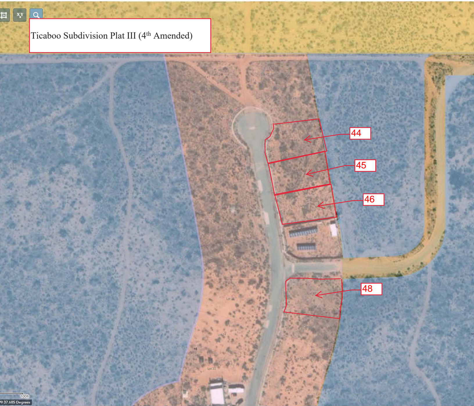
Ticaboo Subdivision Plat III (4 th Amended)